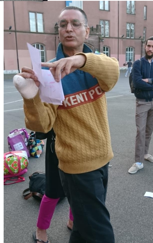
Pic 54. 'Nothing is Outside' by Inder Salim.