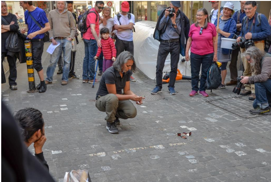
Pic 44. 'There is no Trashcan here' by Manmeet.