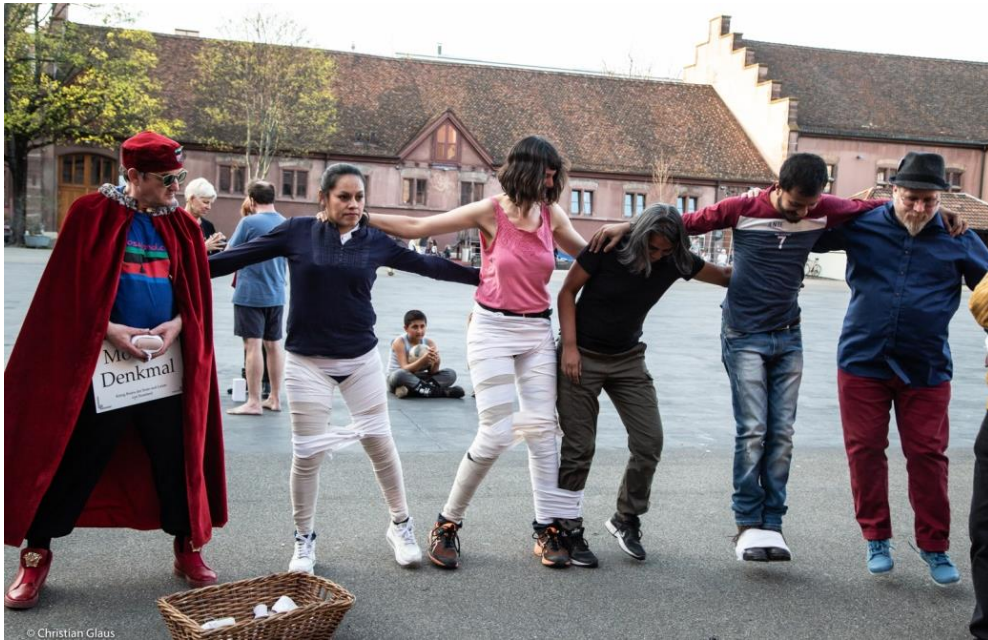
Pic 53. 'Doppelt gemobbelt hält besser (Double-stitched holds better)' by Irene Maag.