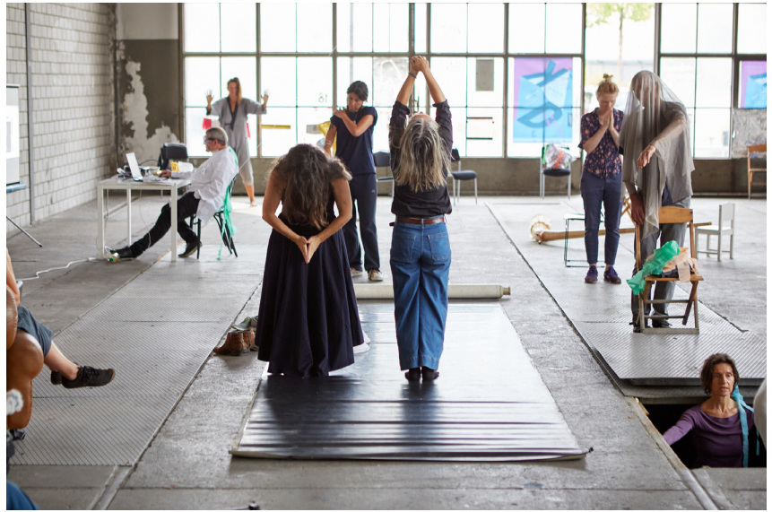
The Gathering, Kunst im Depot, Winterthur, 22.8.2020

happened outdoors. The person that attended the second action came from Braunwald. I think such an action is only fruitful in a festival or an event with several performances and art actions. Still, some interesting impressions stayed, captured in photographs.